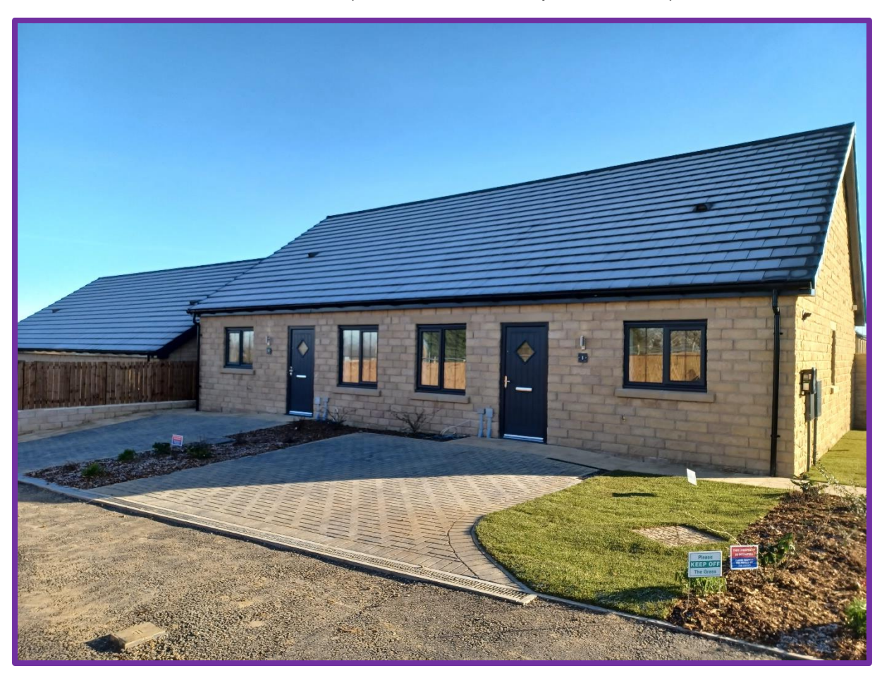
Page 15 of 16

• six homes for Council rent (first of 10 to be acquired in total)