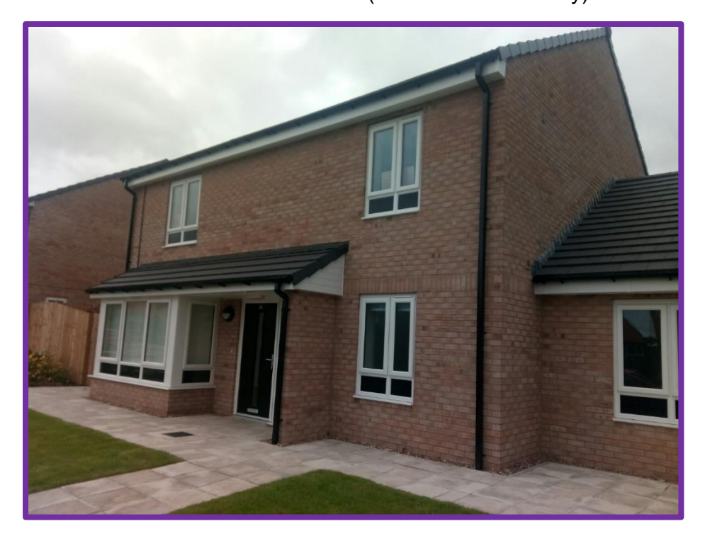
Page 4 of 16

• five homes for Council rent (one leased internally)